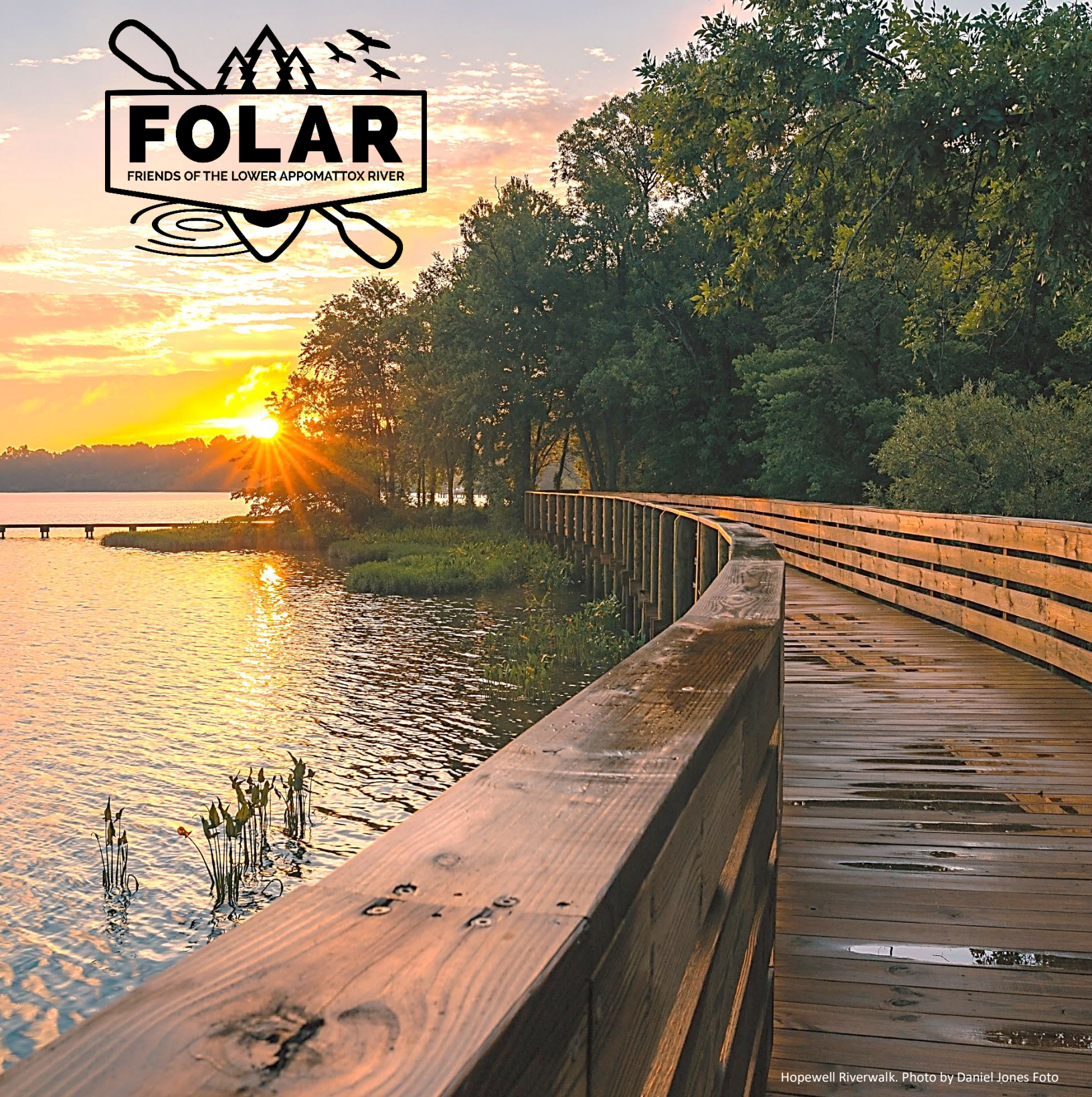
Hopewell Riverwalk.

Empowering Conservation, Stewardship, and Sustainability